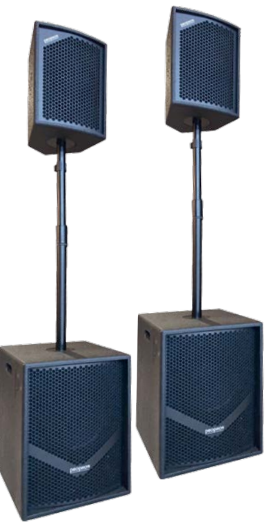
Picture showing two MF8 in an active system with two B11 self powered subwoofers. All amplification and processing are housed in the back of the subs, supplying high quality sound